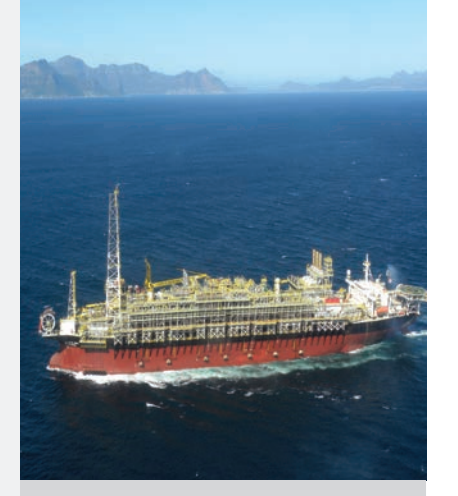
MODEC MV-22 FPSO offshore Brazil has a two-stage Separex membrane system.

MODEC International was looking for a different approach to processing associated gas. The project objectives included a flexible design for variations in feed gas rates and \mathrm{CO}_2 content while re-injecting \mathrm{CO}_2 for reservoir pressure maintenance.